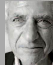
Jack Steinberger, Physicist and Nobel Prize winner

In just three hours, the surface of the Earth receives an amount of solar energy equivalent to the annual world energy consumption